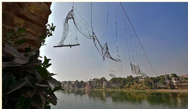
bridge, reported PTI.